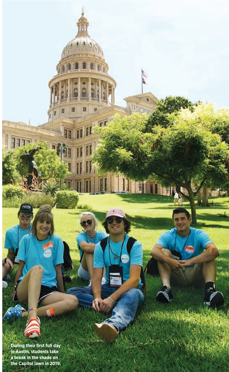
During their first full day in Austin, students take a break in the shade on the Capitol lawn in 2019.

After six inspiring days, they return to Austin—exhausted, elated and sad to see the trip come to an end. But before they say their final good-byes, they get one last hurrah at the farewell celebration dinner, talent show and dance. Surrounded by family and newfound friends, participants reminisce about the week that just was, its heartwarming highlights and life-altering lessons that they’ll carry with them for years to come.